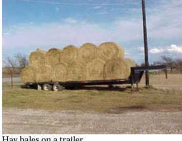
Hay bales on a trailer.