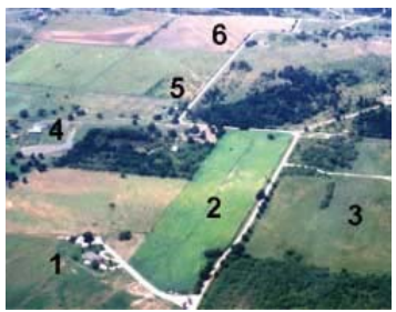
Cattle operation use sites: (1) farmstead or headquarters; (2) hay pasture; (3) livestock pasture or rangeland; (4) farm pond; (5) orchard; (6) field crops.

Create a rough map of your cattle operation or use an aerial photograph. Your operation will include a number of use sites besides pasture and rangeland. On the map, mark the areas where fire ant control is most important to you. Management options are provided below for six use sites.