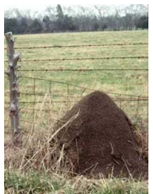
Imported fire ants build unsightly mounds that interfere with farm operations.

Imported fire ants have two colony types: the single queen or monogyne type and the multiple queen or polygyne type. Workers in ant colonies with a single egg-laying queen are very territorial and will fight with fire ants from other colonies. Worker ants in colonies with two or more egg-laying queens do not have this territorial behavior. Therefore, these polygyne fire ants occur in much higher densities because the mounds they build can be closer together. More mounds and ants mean more problems in areas infested with the polygyne colonies. The single queen colony is predominant throughout most of the southeastern United States while the multiple queen colony is predominant throughout the eastern two-thirds of Texas.