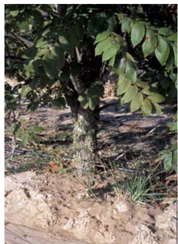
Fire ant mound near pecan tree trunk in orchard.