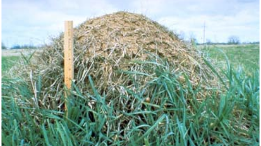
Large fire ant mound in pasture

The U.S. Department of Agriculture's Animal and Plant Health Inspection Service (http://www.aphis.usda.gov/plant_health/plant_pest_info/fireants/index.shtml)_has developed a quarantine and regulatory program to help prevent spread of this exotic species from infested to non-infested parts of the United States. See latest quarantine map (http://www.aphis.usda.gov/plant_health /plant_pest_info/fireants/downloads/fireant.pdf).