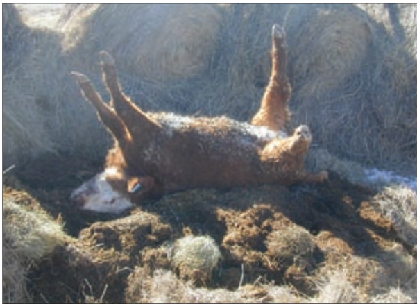
Figure 3. The limbs may need to be removed with a hacksaw, bolt cutters or shears to reduce the pile’s total volume. Lay the severed limbs beside the carcass.

CAUTION: If you suspect the animal died from a zoonotic disease (one that can be transmitted to humans), do not open the carcass. Instead, notify your veterinarian and local authorities immediately.