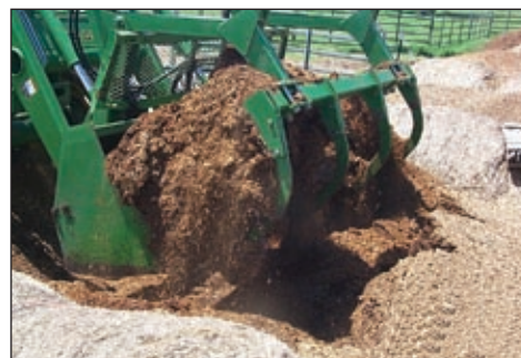
Figure 2. A front-end bucket/grapple loader is a versatile piece of machinery for depositing carcasses (left) on a compost pile and for building (center) and turning (right) the pile.