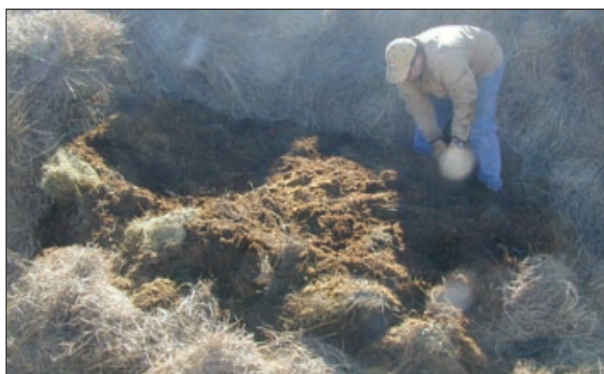
Figure 4. The co-composting material being used here is a moist mixture of horse manure and wood shavings bedding from a veterinary clinic.

To reduce odor and predator access even further, some composting specialists recommend covering the finished pile with the same dry materials used as the absorbent first layer. Doing so will improve pile insulation and heat retention, reduce oxygen transfer, and increase the volume of compost feedstocks. But it may not eliminate all odor and predators, and it is more