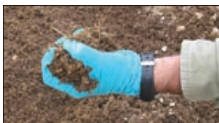
Figure 7. Monitor the moisture content of the pile.

If they do, that sample of material is too wet. If not, drop the material and look at the palm of your hand. If it does not have an obvious sheen of water on it, the sample was too dry.