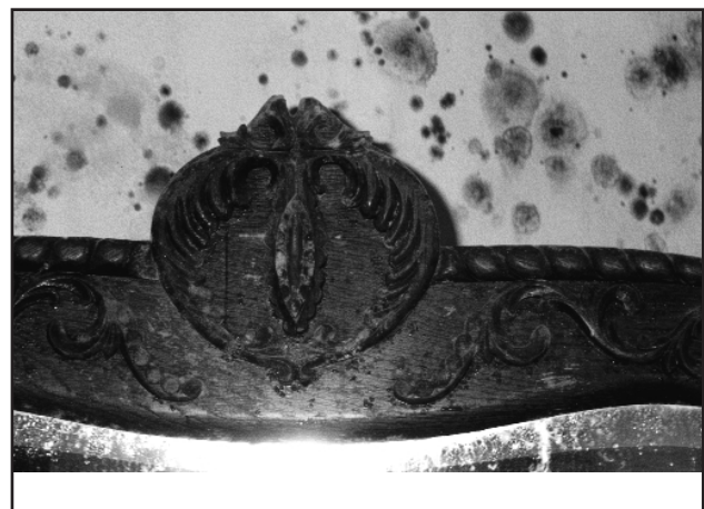
This antique bed and the wall behind it show significant mold damage.

The food source can be any organic material such as dust, books, papers, animal dander, soap scum, wood, particle board, paint, wallpaper, carpet and upholstery. When such materials stay damp (especially in dark areas with poor air circulation) mold will grow. Flooding, pipe leaks, leaky roofs, moisture in walls, high indoor humidity, condensation, and poor heating/air-conditioning system design and operation can create the damp environment mold needs to grow.