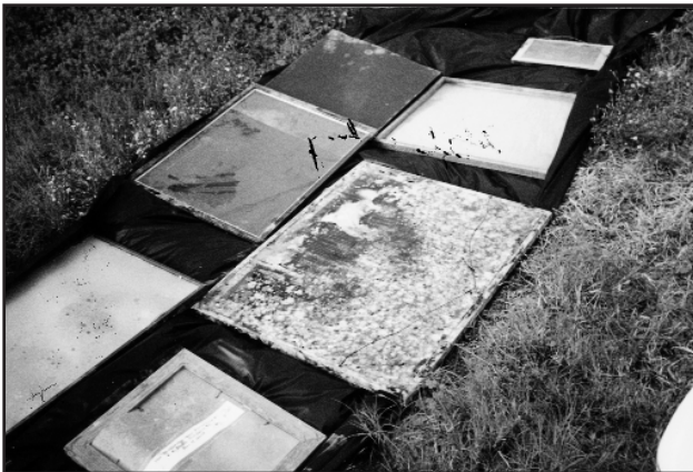
These moldy pictures and frames have been removed for cleaning.

mildew growth. If shower curtains and liners become mildewed, replace them.